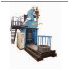
Booth No.: G17

Experience efficient and high-quality wire production with their groundbreaking No Twist Coiler (NTC) technology. This innovative solution accelerates wire drawing and uncoiling processes with a unique coiling technique that differentiates it from traditional gooseneck and spooling machines. Achieve perfect pattern-laid coils up to 4.5 tons in inverted carriers for convenient shipping options and fewer stops when uncoiling. Benefit from unlimited speed, reduced scrap wire, and operator-friendly processes with a straightforward cast and helix setup. Revolutionize your wire production and elevate your operations with the No Twist Coiler Technology.