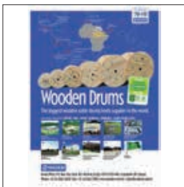
Booth No.: G09

A leading producer of nailed wooden reels with headquarters in Brazil and manufacturing plants in several countries, including Spain, Bahrain, USA, Mexico, and Colombia. Since 1949, Madem Reels Group uses highly advanced technology to manufacture a variety of wooden reels ranging from 500mm to 3200mm in large volumes. Their wooden reels are of high quality, environmentally friendly, and enhanced by ISO 9001 & 14001 certifications. All their drums are made with renewable KD wood with HT stamped as well as PEFC/FSC stamped.